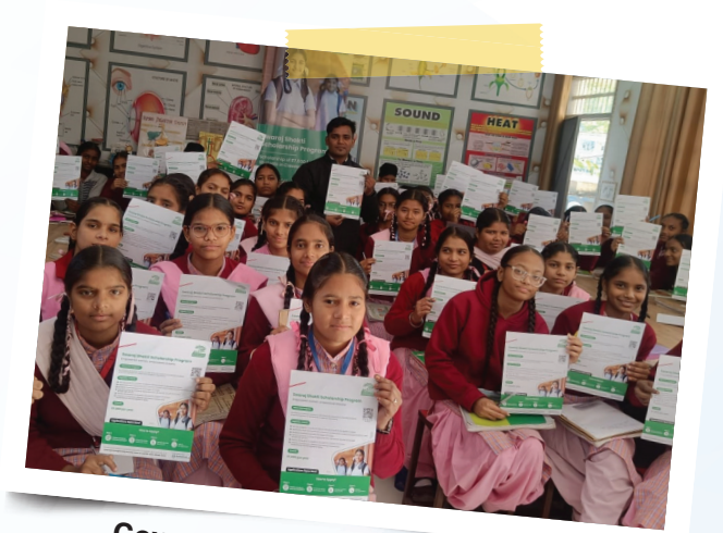
Government Girls Senior Secondary Smart School, Sohana