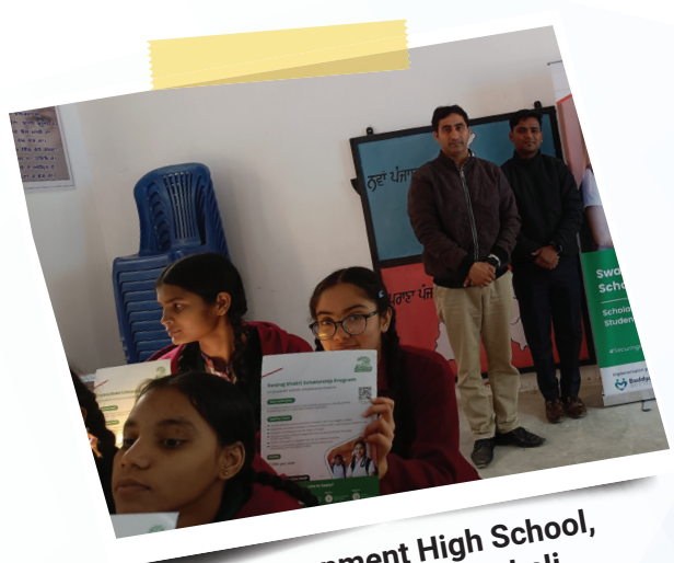
Government High School, Desu Majra, Mohali