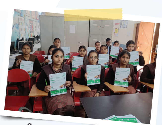
Government Senior Secondary School, Dera Bassi