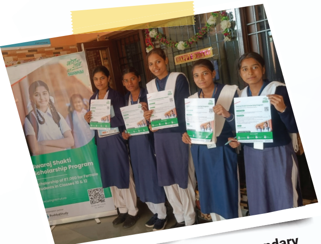
Government Girls Senior Secondary Smart School, Majatri